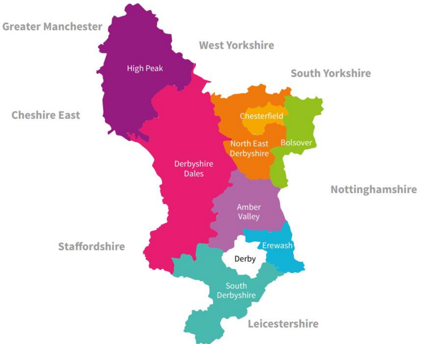
Figure 1 – Derbyshire Enhanced Partnership Area (excludes Derby City)

Derbyshire, with its extremely varied topography and economy, is served by a mixture of bus services. At its core is a network of commercial services. The types of commercial bus services operated in Derbyshire range from urban networks in towns such as Chesterfield, to longer routes that link market towns and villages within the county, to interurban services that link settlements in Derbyshire with towns and cities in neighbouring authorities such as Sheffield and Nottingham. Many services in the south of the county also serve Derby City itself. Filling the gaps in this commercial network are the Council’s supported bus services.